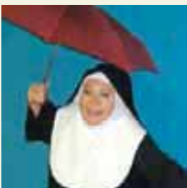
NUNSENSE October 30, 2008