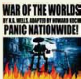
LA Theatre Works: The War of the Worlds & The Lost World October 17, 2008