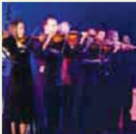
Bowfire October 25, 2008