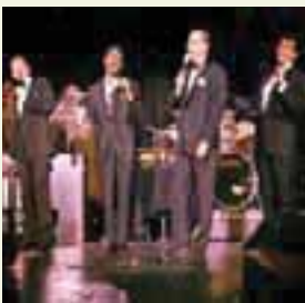
The Rat Pack is Back September 30, 2008

for more information please visit www.jccmi.edu/events or call the Potter Center Box Office at 517.796.8600