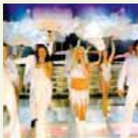
Dancing Queen November 1, 2008